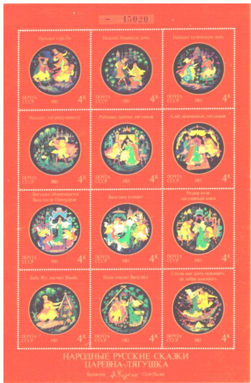
Editor's Note: I reset the brightness and contrast of the sheet so that you may see the gold imprint on the sheet.

The fine Palekh village paintings are best known on lacquerware boxes and other wooden items. The minute details on the paintings are extraordinary and oftentimes rendered with a single strand of hair of a paint brush. Consequently, such items are very costly.