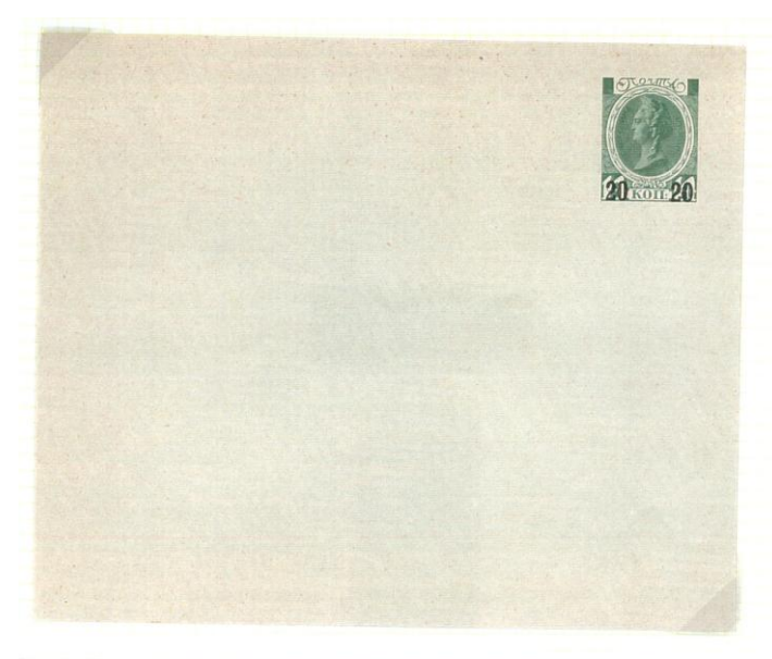
20 / 14 kopek postal stationery envelopes.

The 14k Romanoff stationary envelopes with the imprinted Catherine II stamp were overprinted in black "20.....20" in exactly the same way as the stamps of the time. The 20/14k Catherine envelope is certainly known in mint (unused) condition as shown here in two sizes. But these are uncommon and are valued in the region of $70 each.