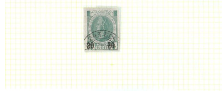
'Cut out' stamp 20k / 14k, from stationery-envelope. Used with pmk of TPO CHITA - 243 - BOCHKAREVO of Trans-Siberian Rlwy.

marks of routes 243/244, Chita-Bochkarevo out in Siberia, never had oval types. Perhaps the older circular types never wore out and were never replaced.